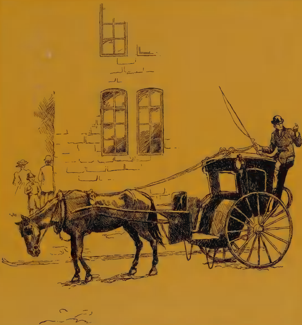
A shabby old cab drove up beside ours